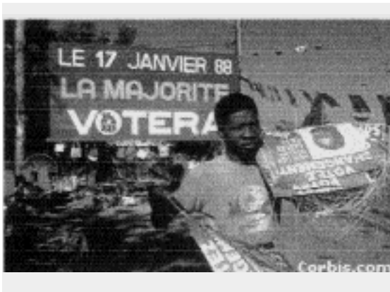
A Haitian young man hangs up a string of broadside sheets for his candidate for president.

The ideal of democracy — that government must be answerable to the people it serves — has a universal appeal. But as noted in the UNDP Human Development Report 2002, democracy has delivered less than people expected. In the words of that report: “Many fought for — and won — democracy in the hope of greater social justice, broader